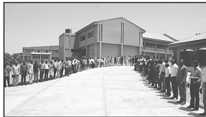
Students on our new driveway