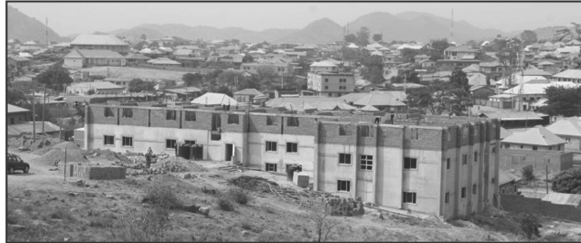
Pouring the lentils for the second floor