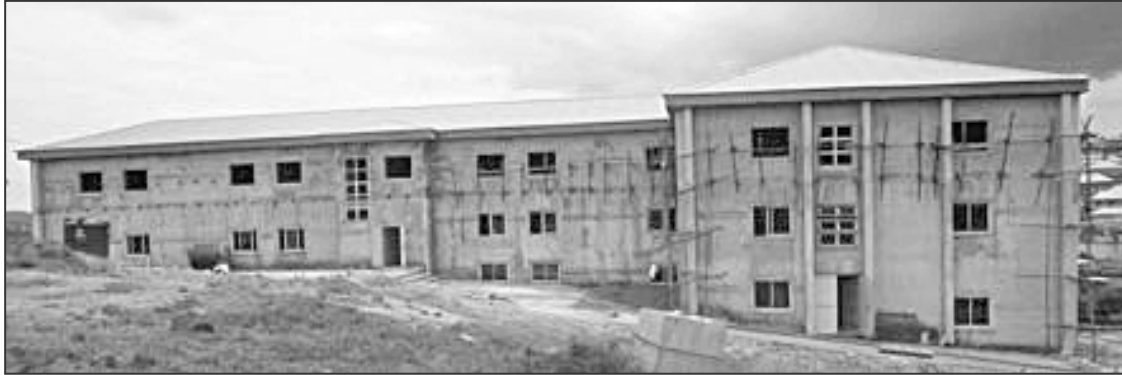
The Roof is Finished

Shifting our male students to the new dorm allowed us to make the old dorm available to our 22 female students who have been living off campus. This dramatically increases the comfort and security for all our students. May our Lord bless the many brethren who contributed their money and their prayers to this project for the Master.